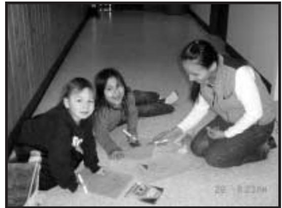
Lutselk'e's Valentine's Family Literacy Night

Take advantage of the many wonderful holidays, specials days, seasons or events we have. Pick a theme and hold a family literacy night. Families can create crafts, read books and take home activities related to the theme.