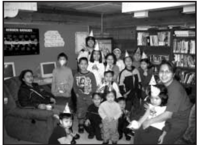
Book Birthday Party in Wekweti

Wekweti is running several family literacy programs. Twice a year they hold a Book Birthday Party for children in the community. They give all the children in the community a book for their birthday and do related literacy activities at the celebration. They will be opening a Toy and Resource Lending Centre at the Community Learning Centre. The centre will have books, books on tape, Dogrib resources and educational games. The centre will be open twice a week for families. They will also hold special event evenings where they read books together and do crafts. Good luck with your new program, Wekweti!