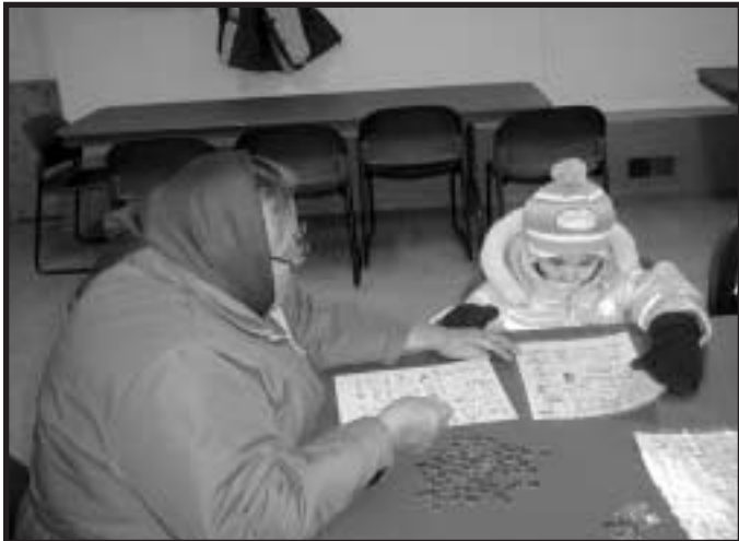
Community members playing Dogrib bingo

Detah is running family literacy Dogrib bingos each week for community members. The Dogrib language class developed a set of Dogrib bingo cards. Each card has a picture and a word that goes with the picture. They usually have around 40 people attend the bingo. Prizes have been donated by local businesses. After bingo they serve traditional foods to the players.