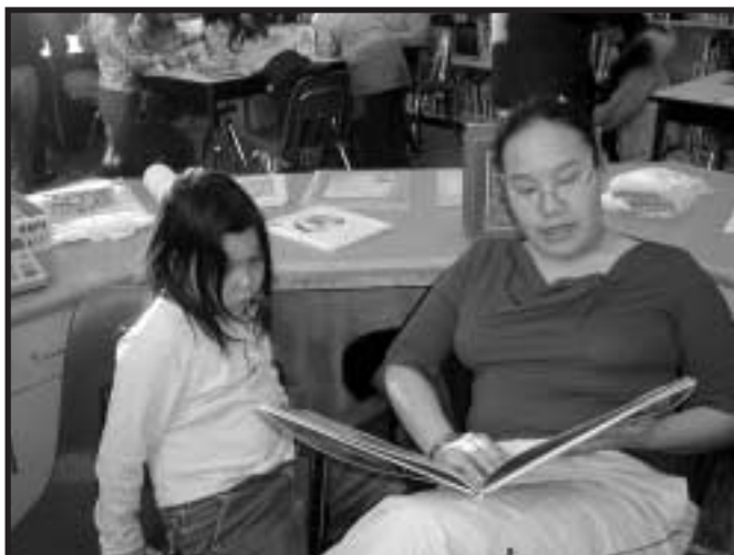
Shared Reading program

Another program that Holman runs is the Traditional Skills program for boys and girls. The program teaches young boys and girls traditional skills such as sewing, tanning and making tools. This is a great way to combine literacy activities with culture.