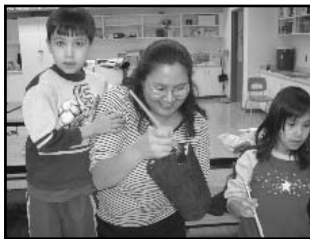
Fort Providence family making the raven craft