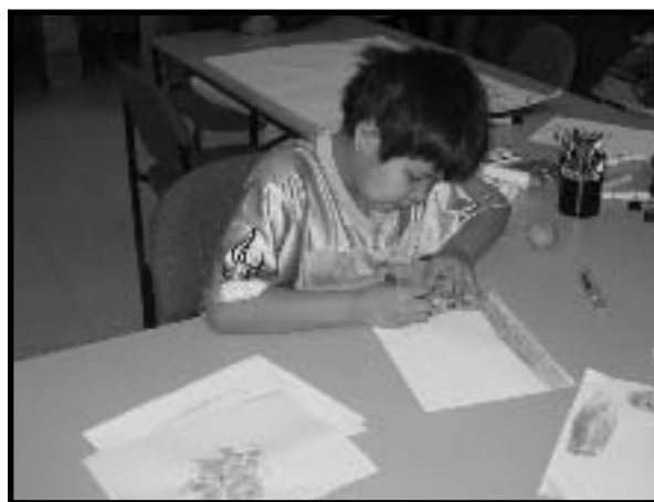
Participants making family portraits.