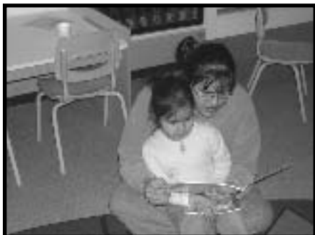
Mother and child read their free book!

They held a _____ for parents in the Aboriginal Head Start Program. Parents and children enjoyed caribou stew and bannock and then learned lots of rhymes and songs. Each family took home several free books!