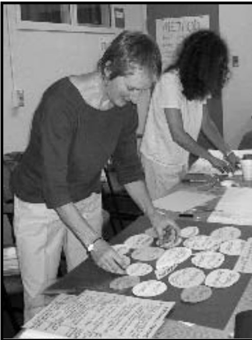
Participants at the Research in Practice Course in St. John's, Newfoundland

Research in practice is becoming increasingly important in the literacy field in Canada. In 2000, a Research in Practice in Adult Literacy (RiPAL) network was established. Since then there have been three Research in Practice gatherings: in Edmonton (2001); in Vancouver (2002); and in St. John's Newfoundland (2003).