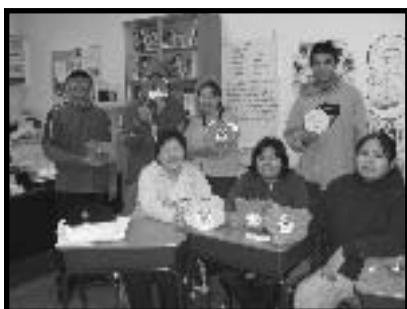
Adult learners show off their home-made books!

The Family Literacy Coordinator also started a Books in the Home program with the adult learners at Aurora College during Family Literacy Week. Participants will learn more about reading to their children over the next six weeks and will take home books each week.